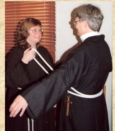
Becoming a novice (above) Making Profession (below)