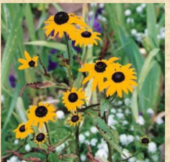
San Francisco, California. St. Francis House and the garden.