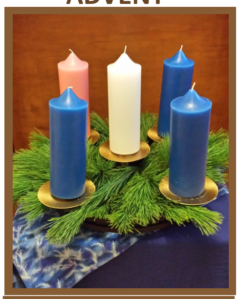
The Advent Wreath before the altar in the chapel at St. Francis House on the eve of First Advent, waiting for the coming of the light.

Advent invites us to prepare our minds and hearts for celebration of the Christmas mystery.