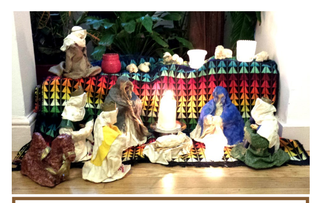
Where we're headed with Advent: The Christmas crèche in the chapel at St. Francis House.

Advent is a busy and exciting time. It's good to take a break from all the preparations!