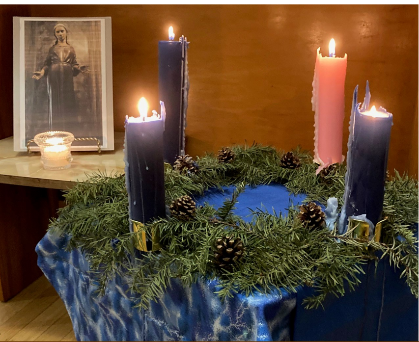
Pregnant Virgin Mary (statue from the Roman Catholic Cathedral in Melbourne, Queensland, Australia) with Advent Wreath Week 4.

Advent began with a voice crying in the wilderness: "Prepare the way of the LORD, make straight in the desert a highway for our God . . . And the glory of the LORD shall be revealed, and all flesh shall see it together, for the mouth of the Lord has spoken." (Isaiah 40:3-5)