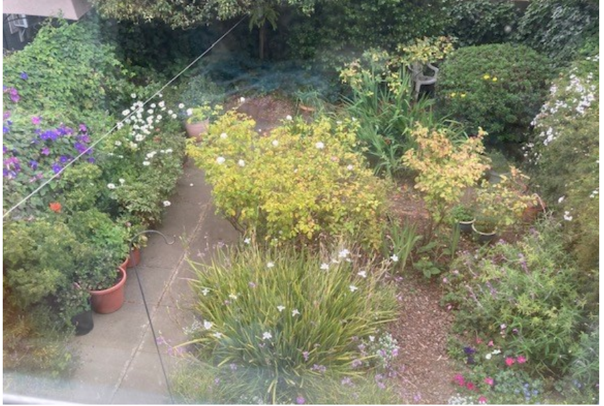
Left: Living room in the guest apartment. Right: Our guest apartment opens out onto the house garden.